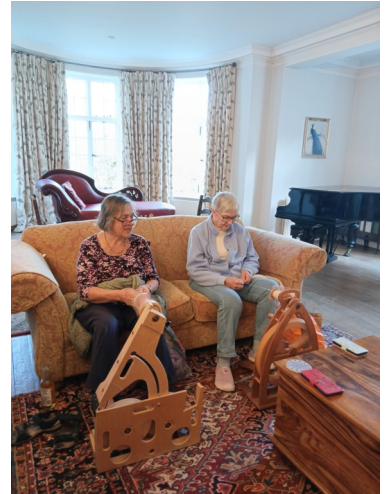
Happy Spinners in the Piano Room

The Royal Welsh Showground was teeming with wool lovers of all ages – and they weren't disappointed with what was on offer.