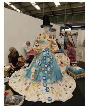
Calico Message Dress

Hand dyed yarns galore, raw fleece, washed fleece, combed and carded fleece, dyed locks, chunky yarns, lace yarns and everything in between. Beautifully crafted looms, wheels, carders, swifts and winders – equipment to try and buy. Several mills – often community restored – showed off their fabulous tweeds and twills. Talented crafts women and men shared their joy in design work, felting, tailoring, dyeing and pattern making. You could make a pair of felt slippers, or personalised sneakers, learn how to hand print a tea towel with exquisite Indian blocks or stitch your own 'busy board' collage. The day ended with the famous Sheep Walk – stunning (and occasionally strange, why would you want to wear a felt chicken's head?) items of clothing made by exhibitors and modelled by volunteers.